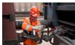
Mobile service (site-independent preventive and corrective measures)