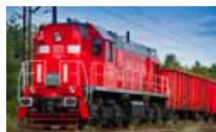
Organisation of maintenance during operation (fixed, preventive and corrective measures)