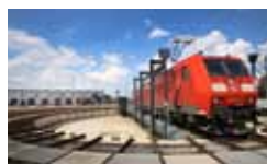
Heavy maintenance including component overhaul work